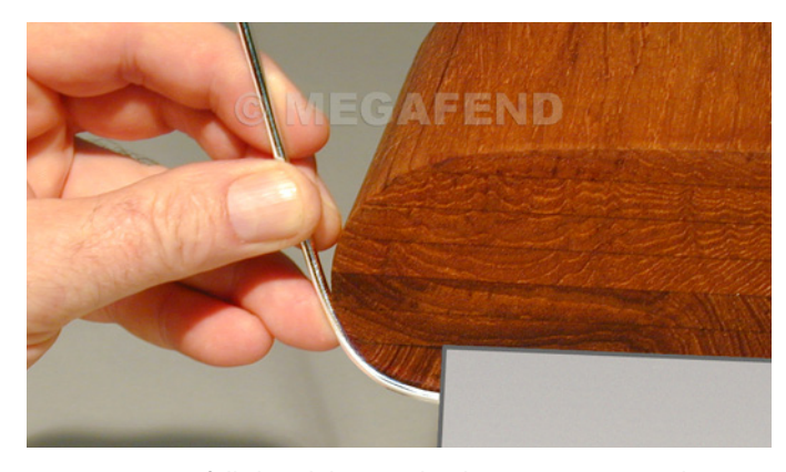
Step 3 — Carefully bend the metal rod or strip to accurately follow the contour of the cap rail.