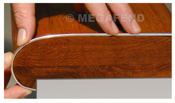
Step 5 — Holding rod securely in place on inboard side of cap rail, gradually and firmly press metal downward to follow top section of rail. Adjust with pliers as needed and check fit.