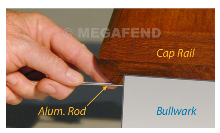
Step 2 — Start template shape tightly flush to inboard side of bullwark where the cap rail joins.

Step 1 — Determine cap rail uniformity (tolerance) by checking cap rail width along area where fender hooks will be used. Tolerance should be within 1/4-inch. Should width vary, the goal is to make your template so that it securely fits the largest area yet not be too loose in narrower area.