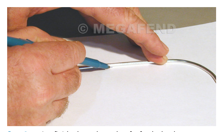
Step 9 — Lay finished metal template for fender hook on paper. Hold firmly in place and carefully trace pattern of inside of shape onto the paper. (A ballpoint pen is preferred for this task.)