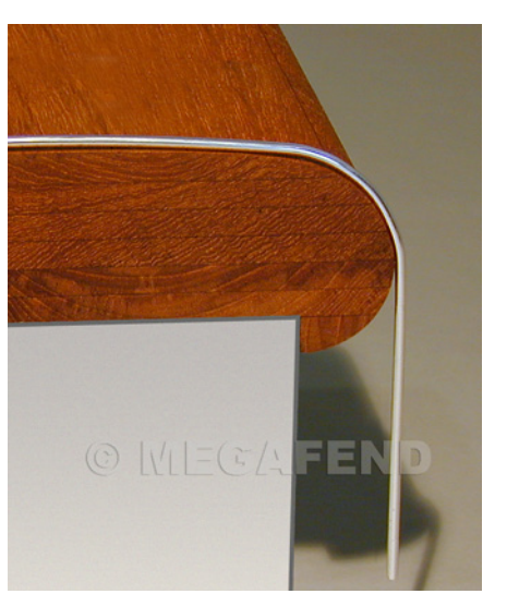
Step 7— Finish bending of template outboard leg to general angle needed. (This leg is commonly set to align parallel to bullwark or given a slight outboard or inboard angle.) Cut off metal to desired length for outboard leg.