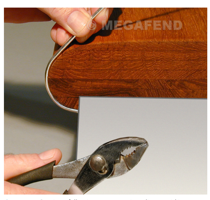
Step 4 — Continue following contour using pliers as aid in bending rod to assure snug fit.