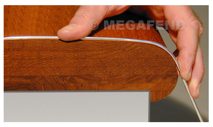
Step 6 — While continuing to hold metal template in place flush against inboard rail side and rail top, start bend around outboard side to approximate outermost point of cap rail profile.